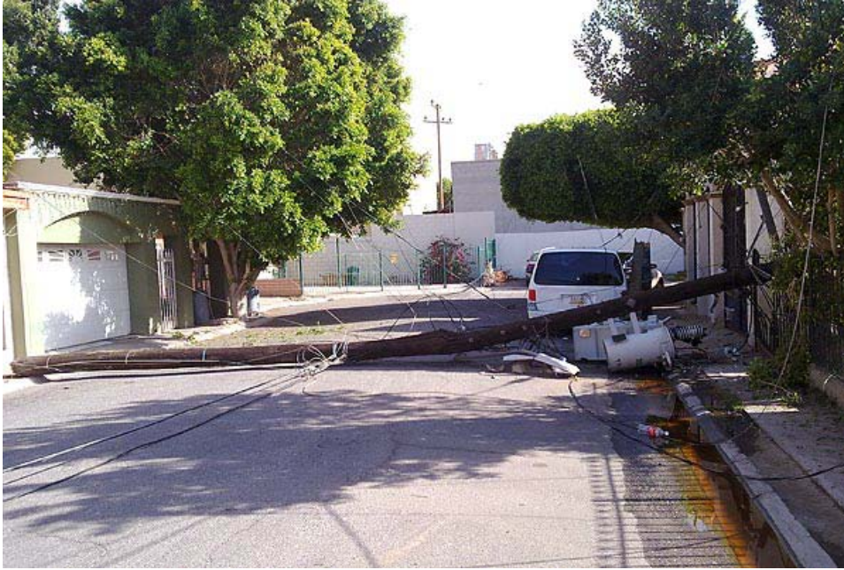
Downed power pole and lines across street in Mexicali.