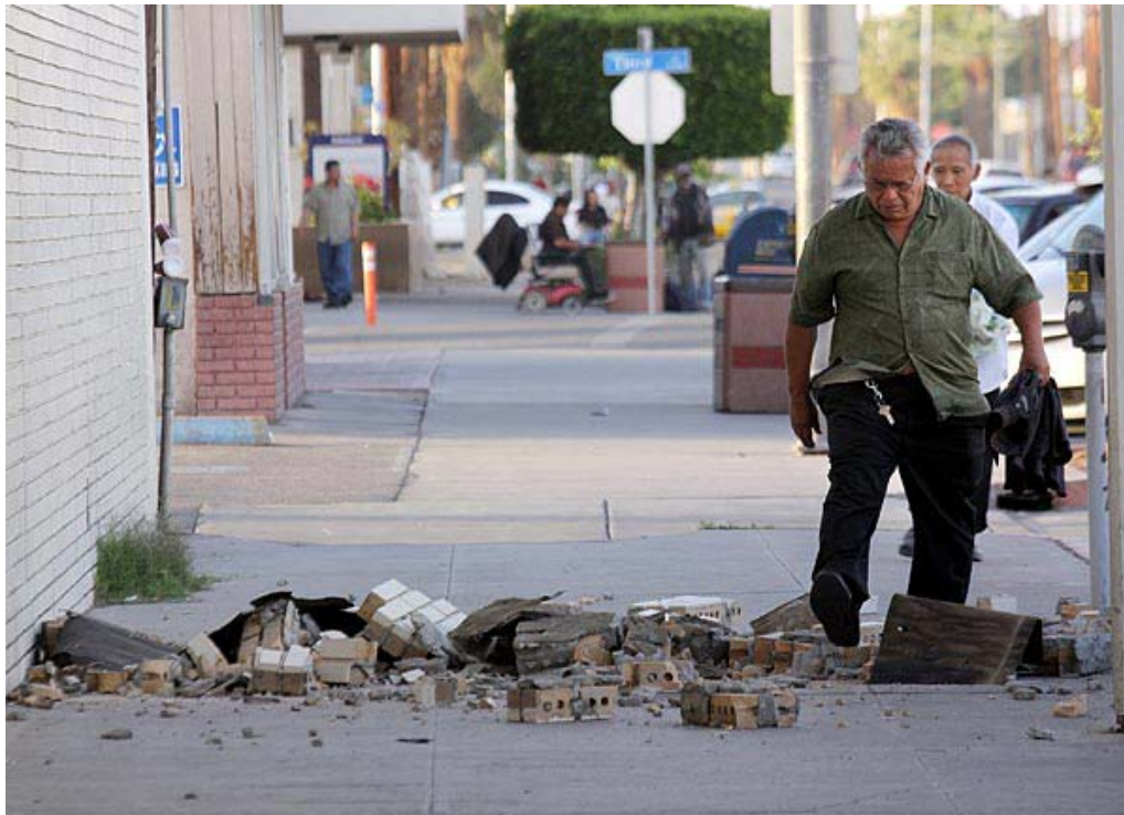
Fallen brick veneer on Calexico sidewalk.