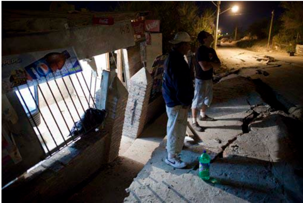
Collapsed house in Mexicali.