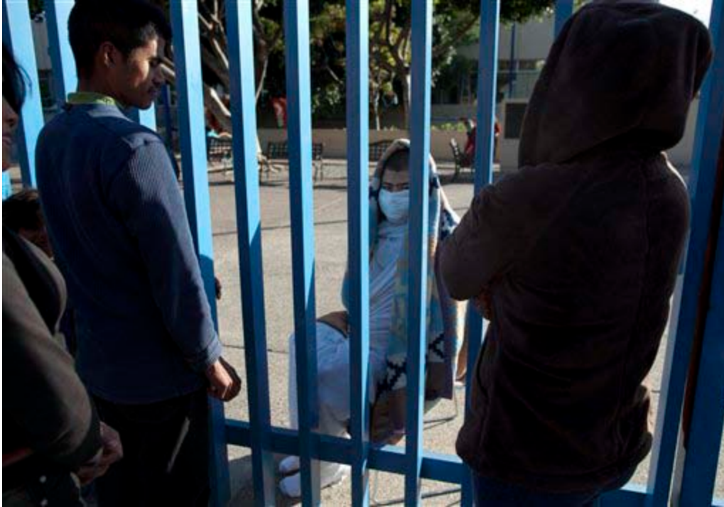
Patient evacuated from 6 th floor of Tijuana General Hospital in parking lot.