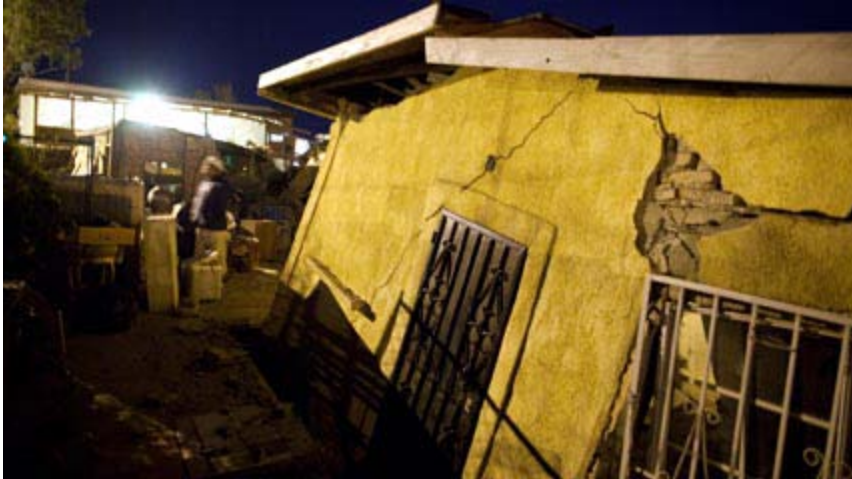
Severely damaged URM in Mexicali.