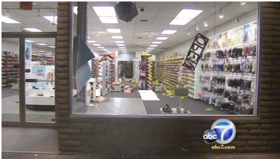
Shoe store in Calexico exterior view.