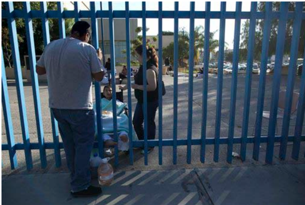
Patient evacuated from 6 th floor of Tijuana General Hospital in parking lot.