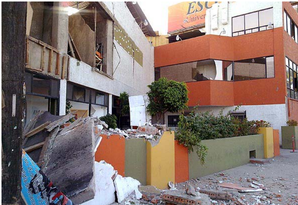
Escomex Business School damage to façade and window breakage in Mexicali.