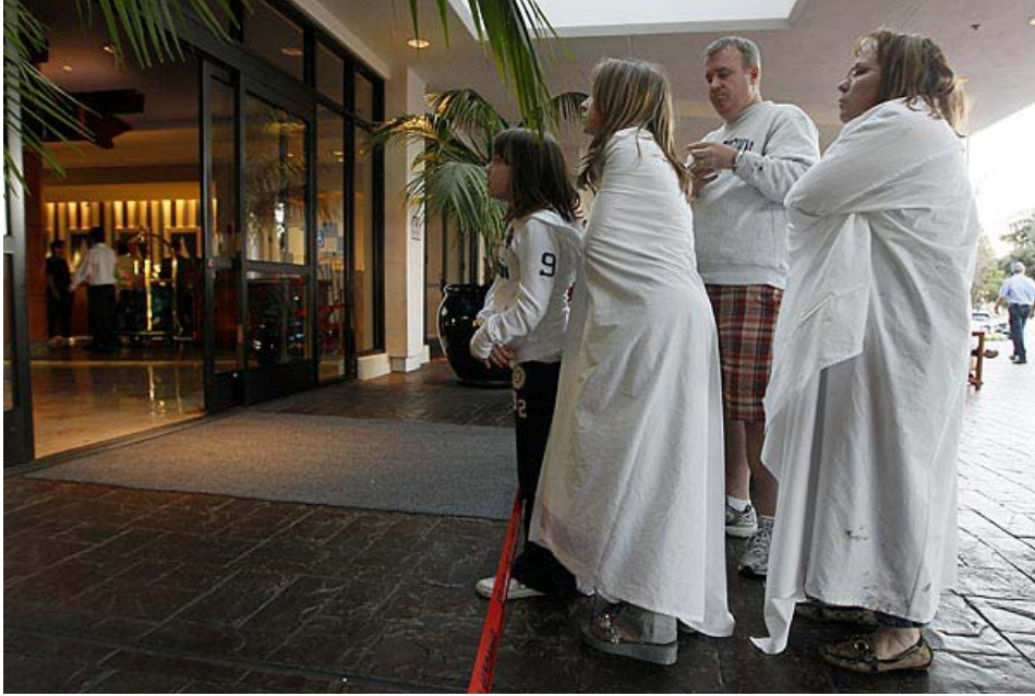
Sheraton San Diego Harbor Island evacuated due to cracks observed in floor, later determined to be safe to enter.