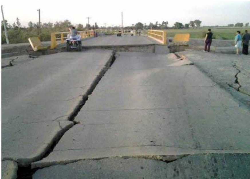
Bridge approach settlement in Mexico.