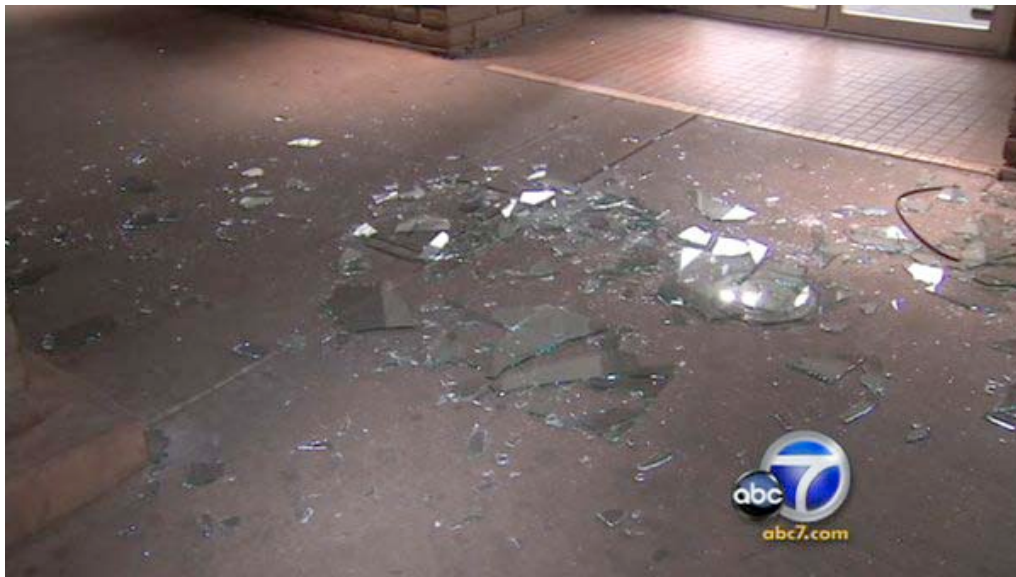
Broken storefront window glass on sidewalk in Calexico.