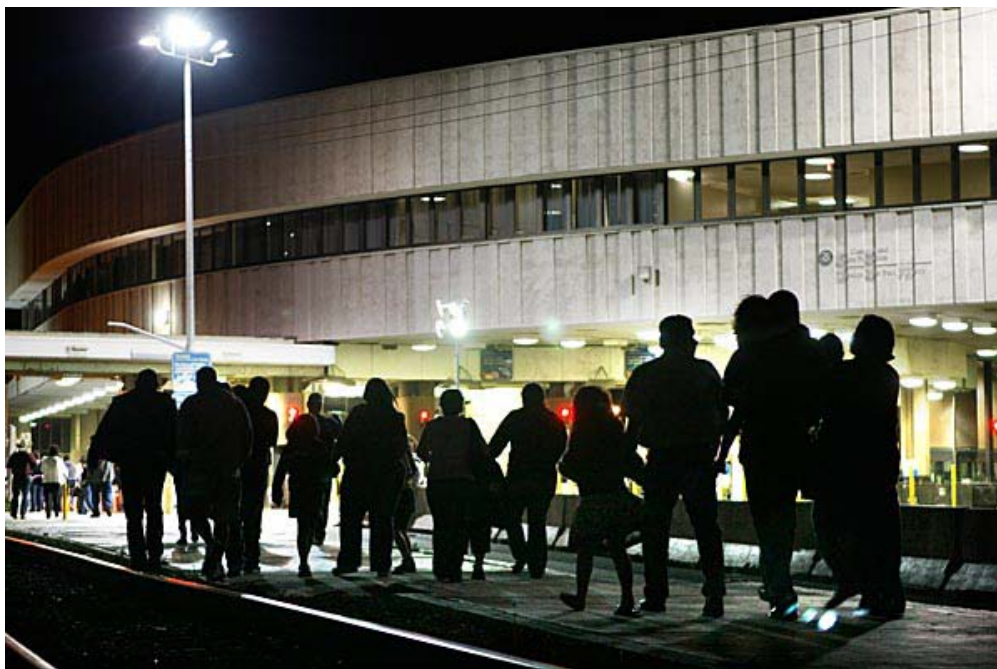
U.S. Customs buildings closed temporarily due to damage at Calexico border crossing. Cars stopped from crossing, but pedestrians northbound still allowed to cross border.