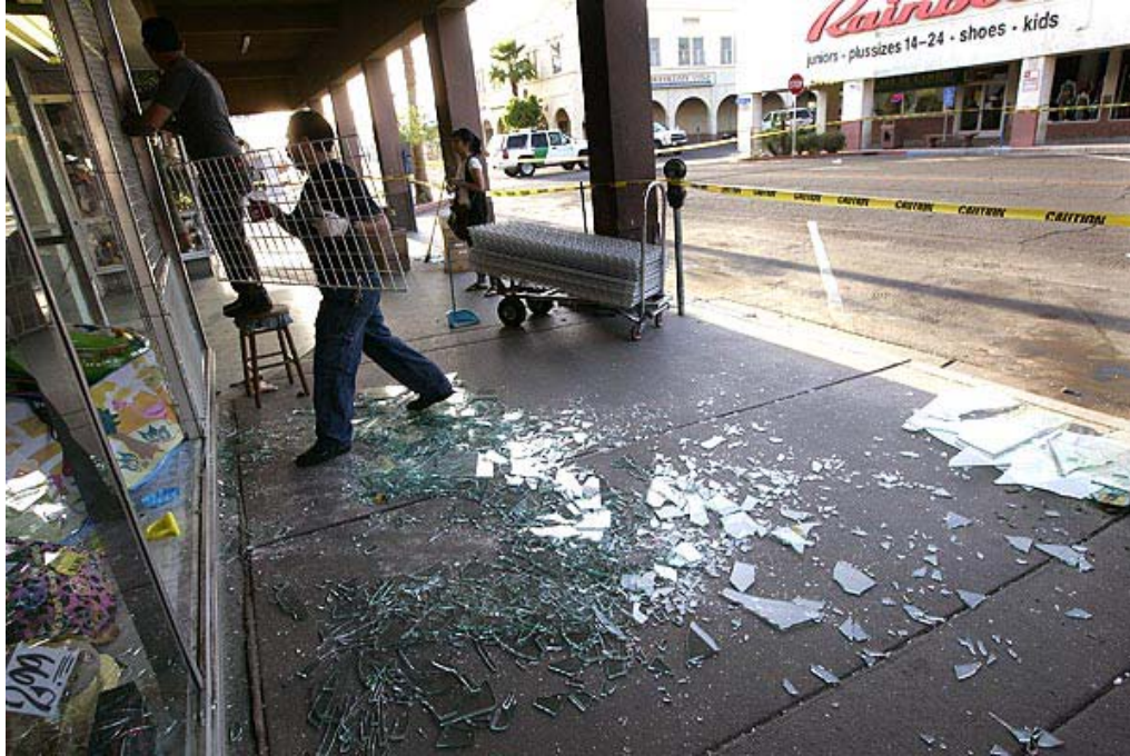
Broken storefront window glass on sidewalk in Calexico.