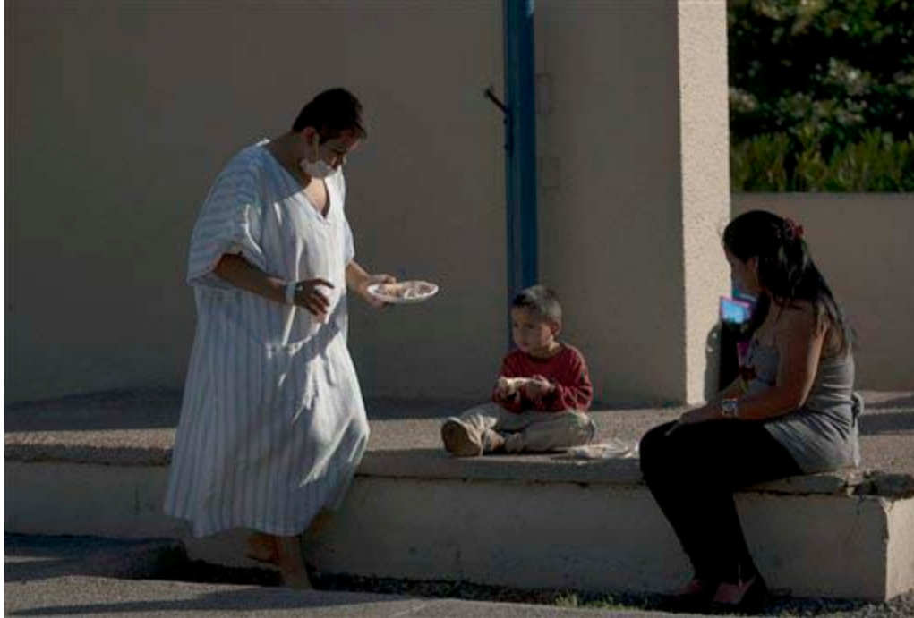
Patient evacuated from 6 th floor of Tijuana General Hospital.