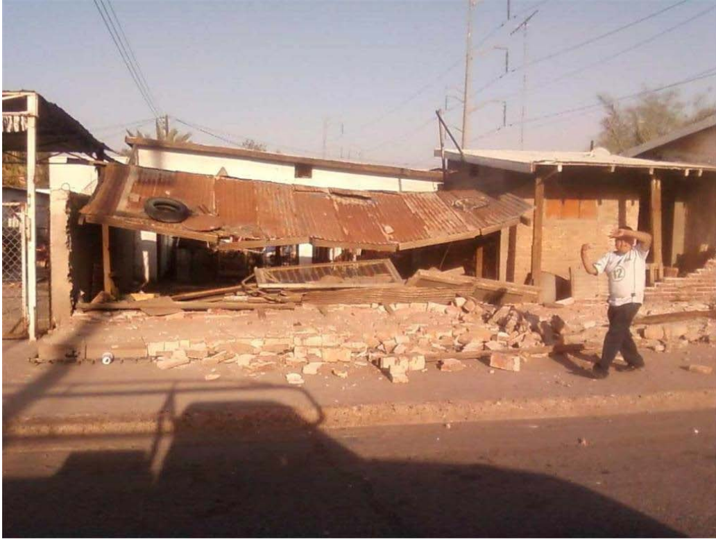
Collapsed roof in Mexicali. Unreinforced masonry rubble.