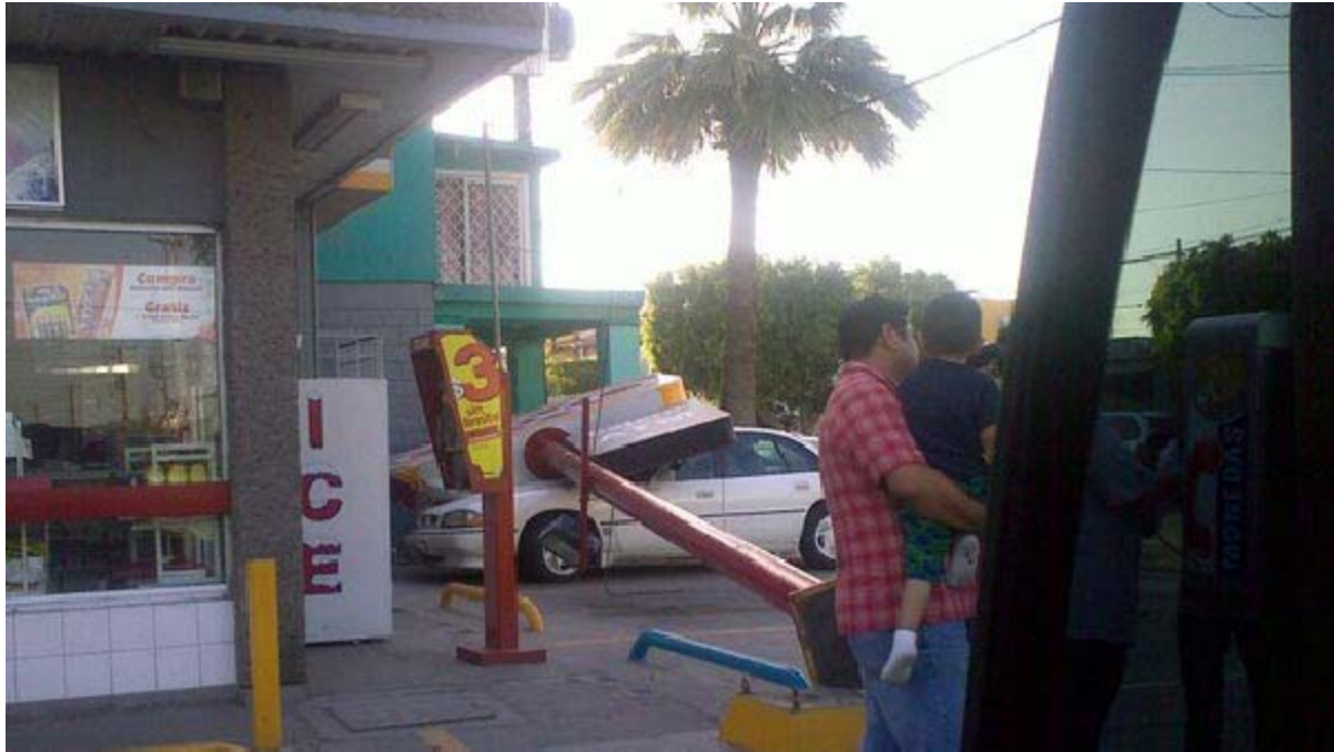
Toppled gas station sign crushing car in Mexicali parking lot.