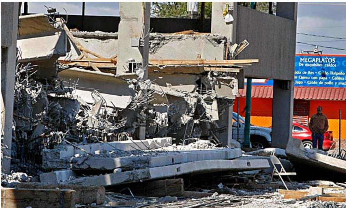
Parking Garage collapse 4 stories under construction at Mexicali Civic Center.