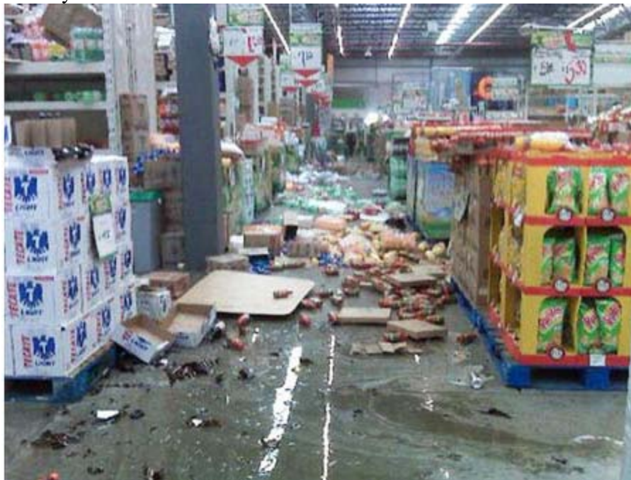
Damage to warehouse store contents in Mexicali.