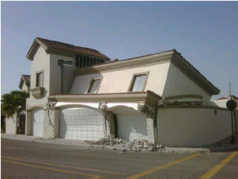
Home partially collapsed in Mexicali. Wood frame at upper floor, plaster finish, masonry piers at first floor.