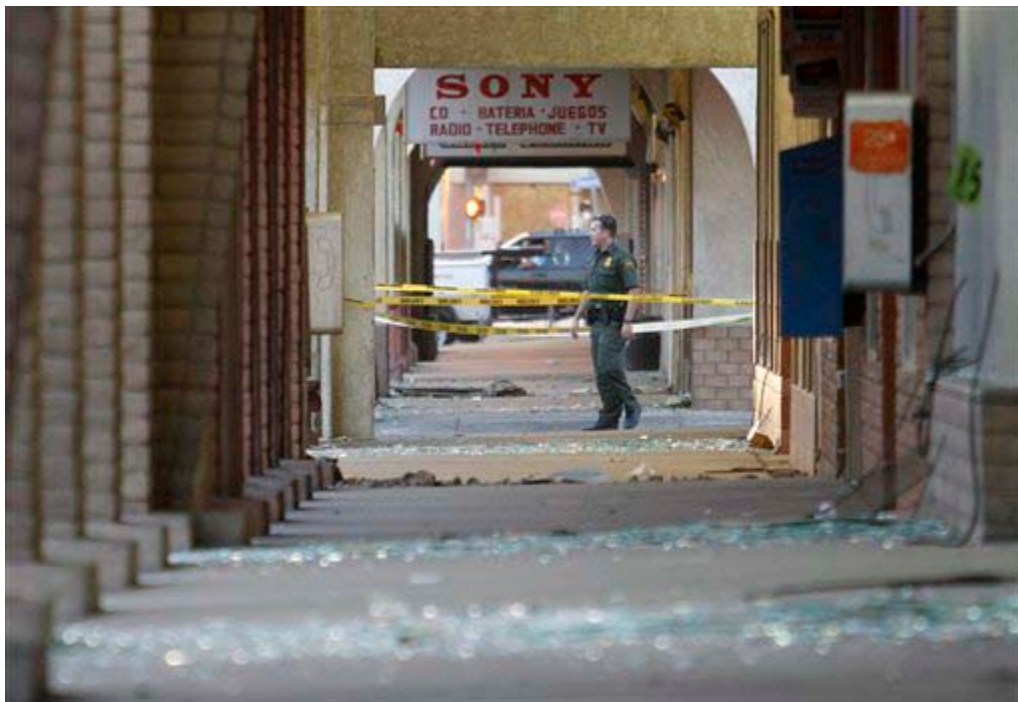
Broken storefront window glass on sidewalk in Calexico with Border Patrol guard in background.