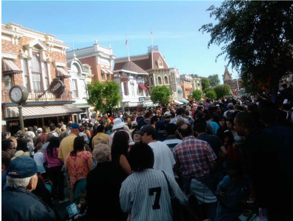
Evacuation of Disneyland.