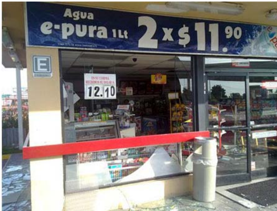
Mexicali storefront window fracture.