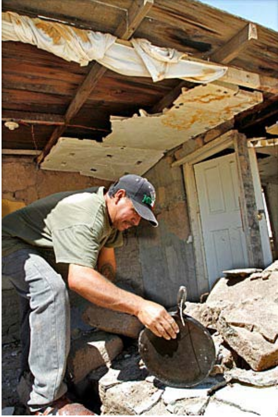
Severely damaged home in Colonia la Puerta.