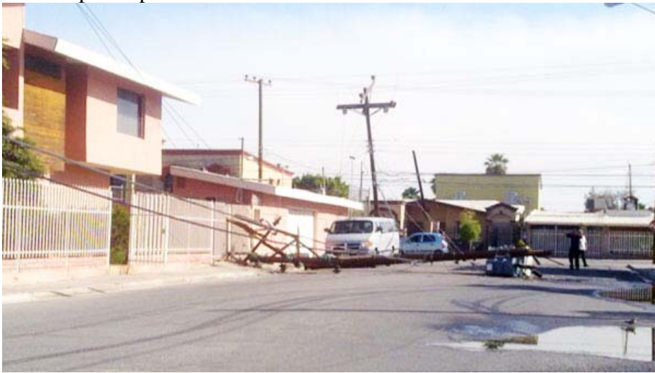
Downed power pole and lines across street in Mexicali.