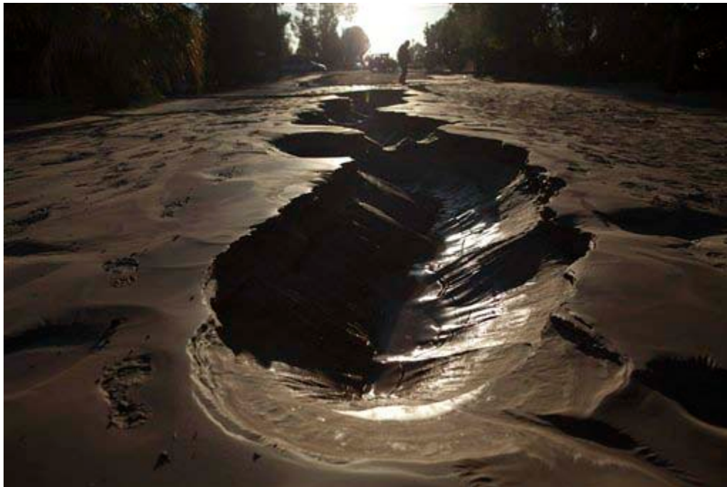
Mud from underground water leak in Mexicali.