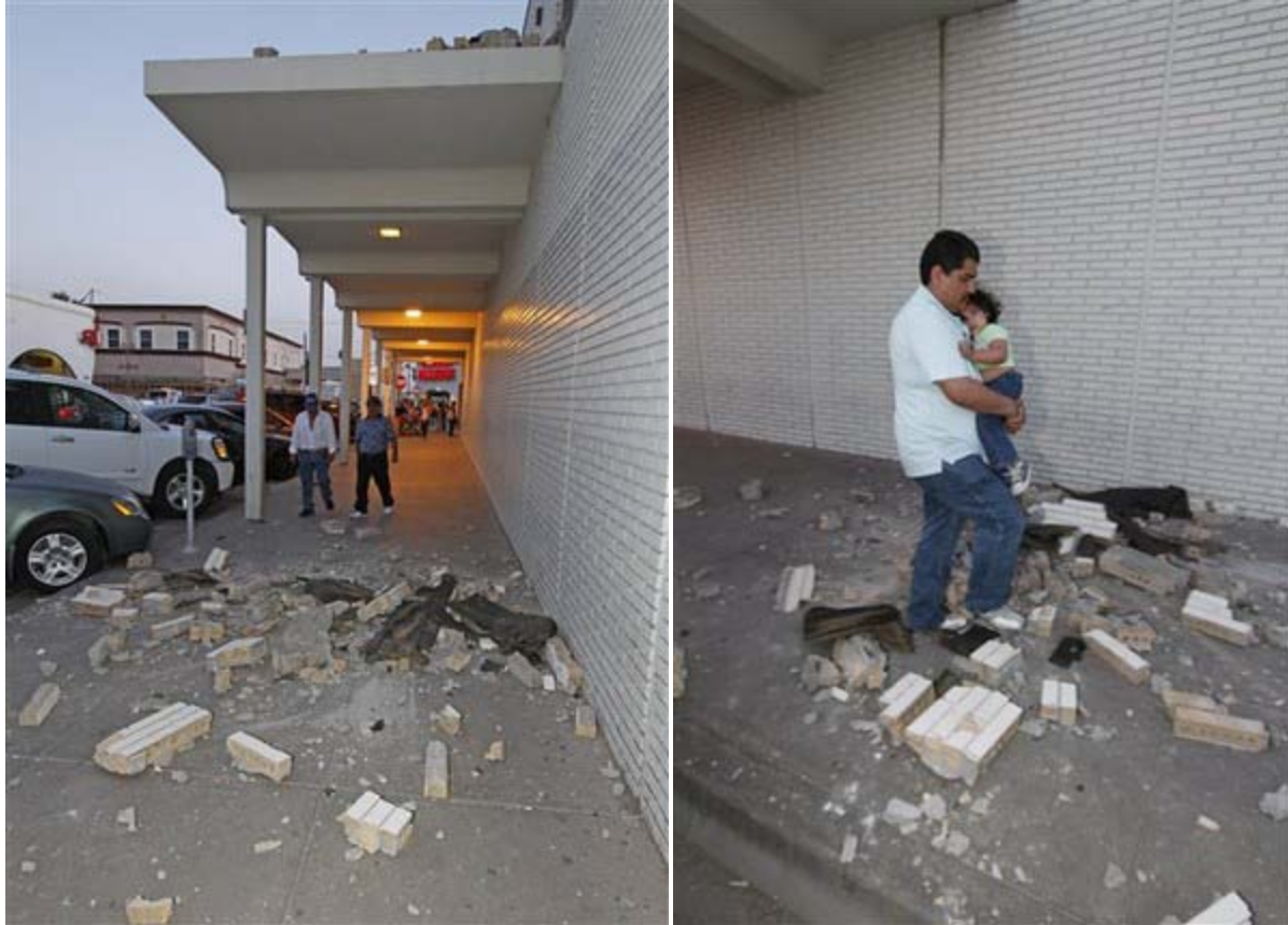
Veneer on Sidewalk in Mexicali. Man walking over debris with child.