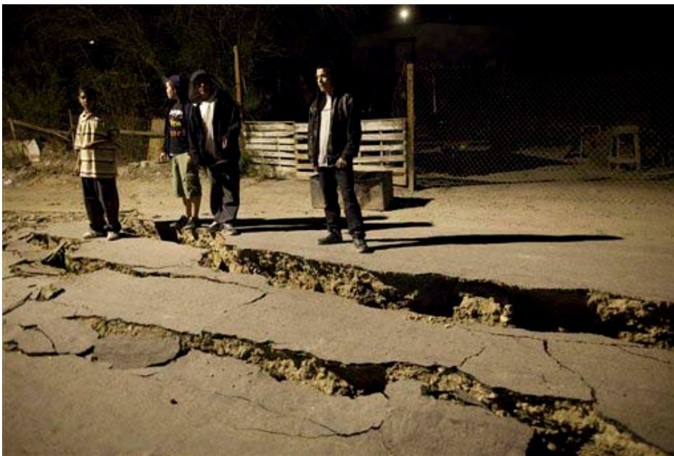
Pavement fracture and settlement in Mexicali.