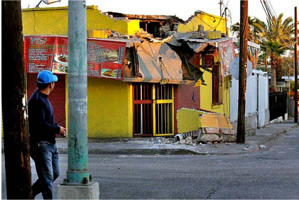
URM store partial collapse in Mexicali.