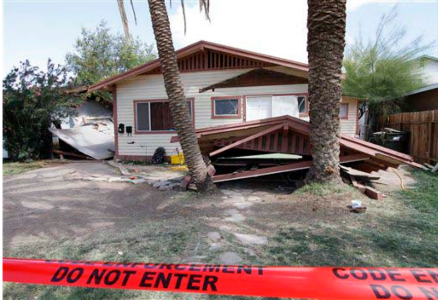
Home partially collapsed in Calexico.