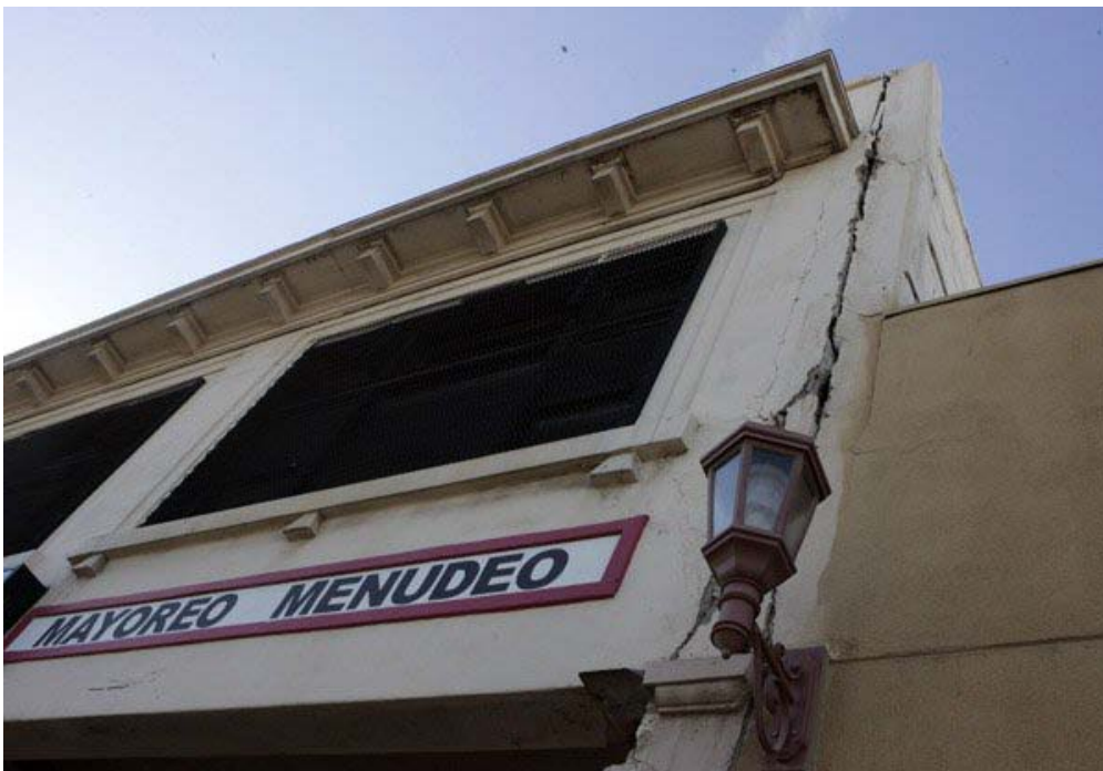
Calexico URM on 2 nd Street with vertical cracks.