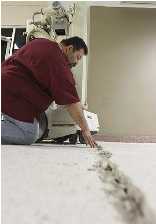
Crack in Mexicali Hospital floor.