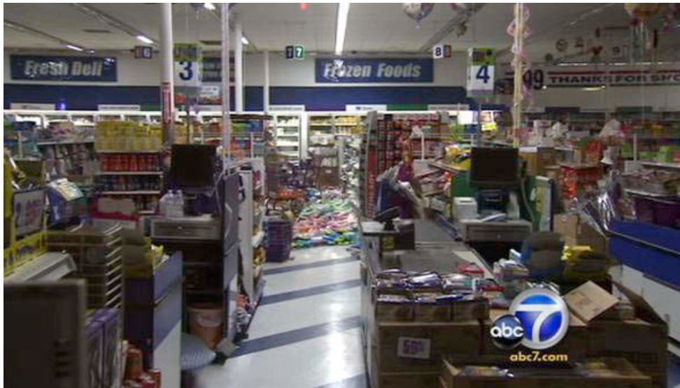
Grocery store contents on floor in Calexico.