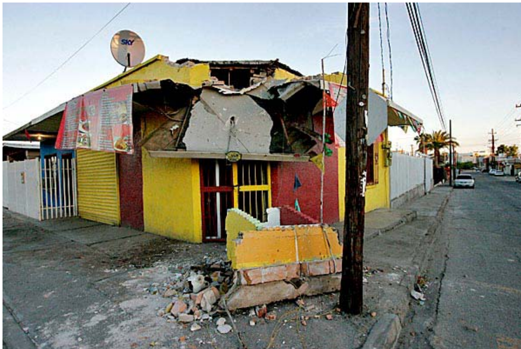
URM store partial collapse in Mexicali.