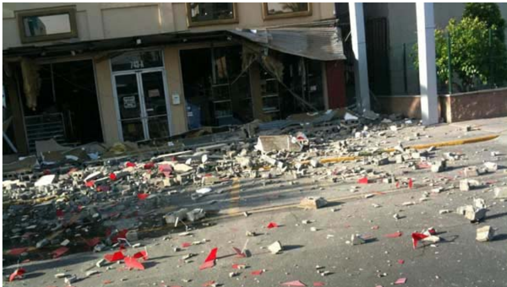
URM rubble on street in Mexicali.