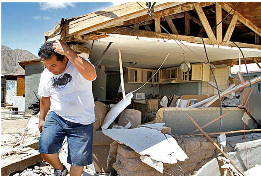
Heavily damaged home south of Mexicali.