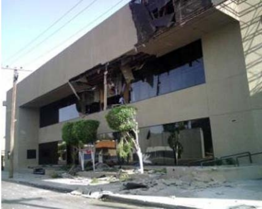
Damage and partial collapse of exterior façade of Mexicali building.