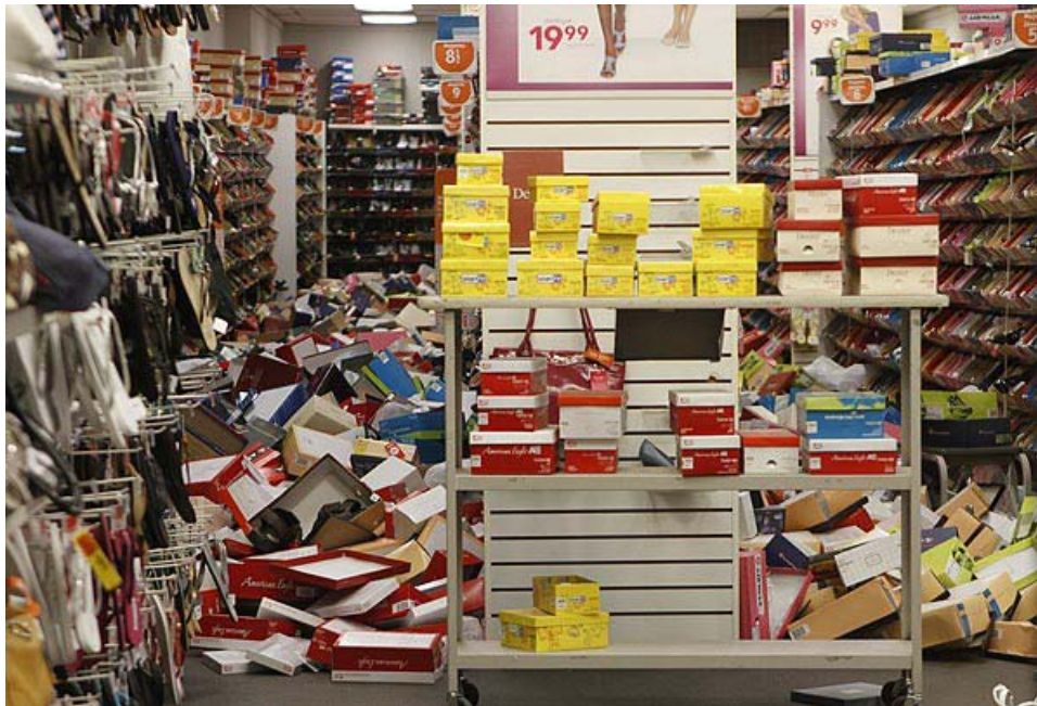
Shoe store contents in Calexico.