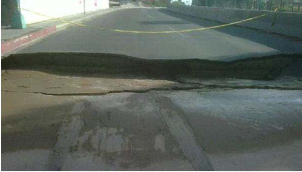
Settlement at bridge approach in Mexicali.