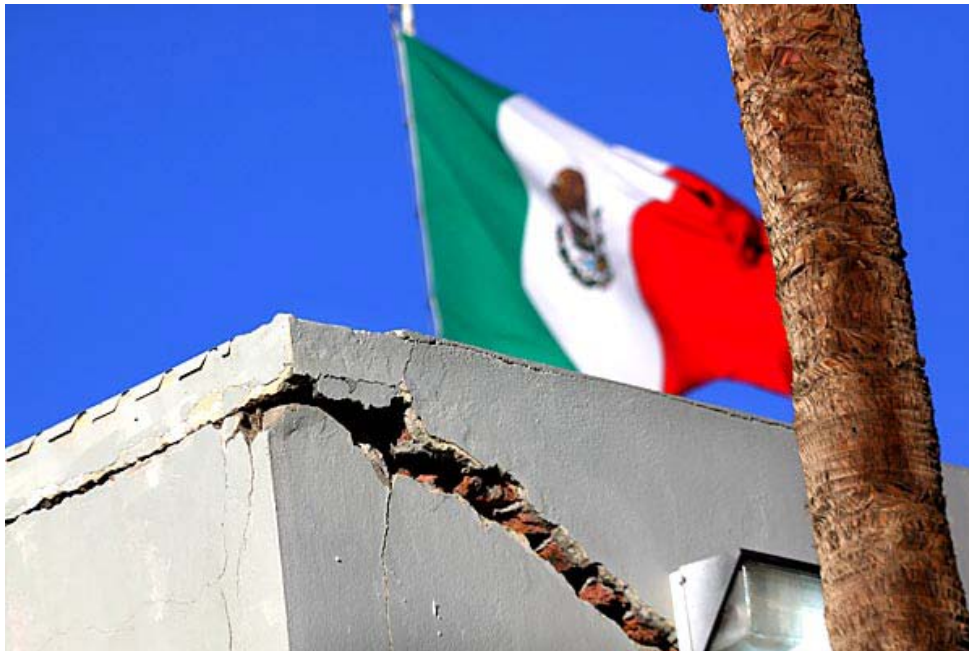
Customs building URM at Calexico damaged.