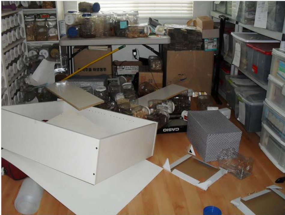
Fallen cabinetry and contents in El Centro.